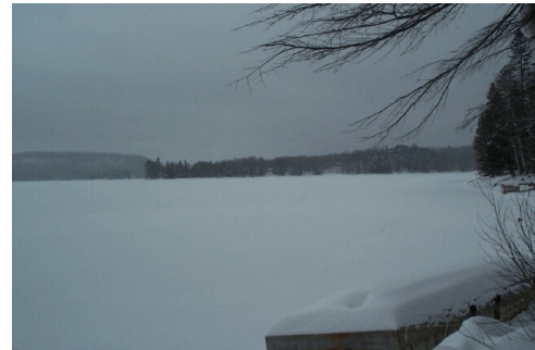
Ice-In Day December 6 th , 2007