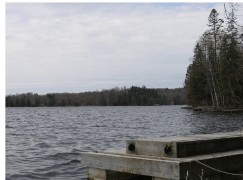
Ice-Out Day April 25 th , 2008